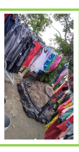
There's lots of water to fill the water barrels, but few days to wash (outside) and dry laundry.

Rainy days are cold days. Eymi and Dylan bundle up.